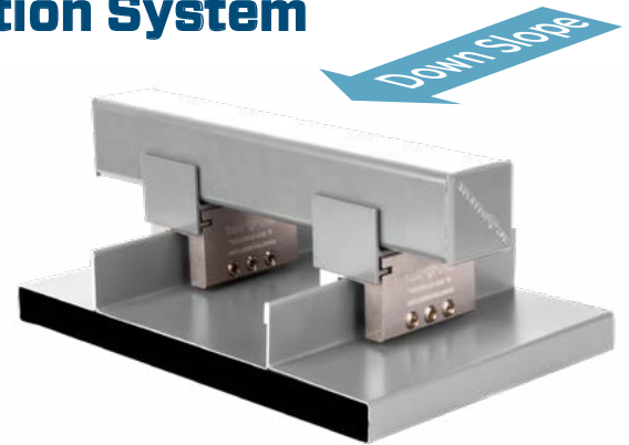
Typical 2" Sno Blockade™ Assembly