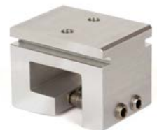
1" Sno Blockade™ Wide