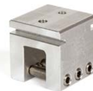
1" Sno Blockade™ Shown

All Sno Blockade™ cubes also available in HD (Heavy Duty) with 5 set screws for heavy snow load applications.