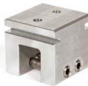
1" Sno Blockade™ Mini