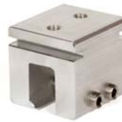
1" Sno Blockade™ KLOC Mini