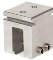
1" Sno Blockade™ KLOC