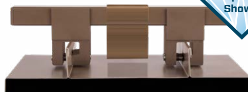
Blockade™ Plate Shown