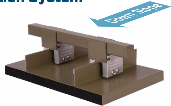
Typical 1" Sno Blockade™ Assembly