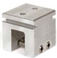
1" Sno Blockade™