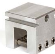
Sno Cube™ HD

All Sno Cubes™ also available in HD (Heavy Duty) with 5 set screws for heavy snow load applications.