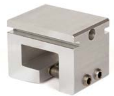
Sno Cube™ Wide