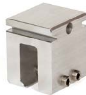
Sno Cube™ KLOC