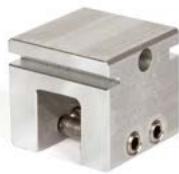
Sno Cube™ Mini