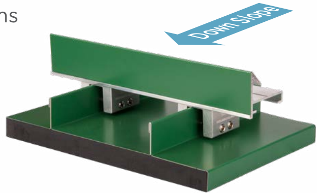
Typical 2" iClad™ Assembly