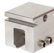
Sno Cube™ KLOC Mini